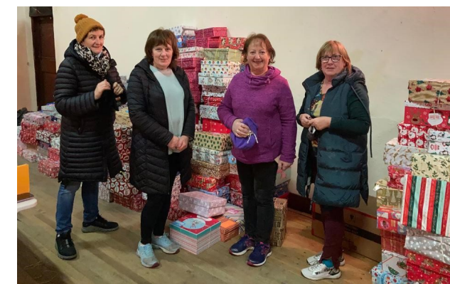
Christmas 2021 and Nollaig na mBan 2022