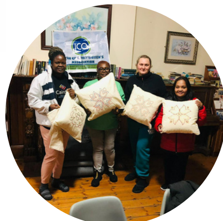
Above some members of Millstreet Guild displaying their cushion covers

In Cork, Eleanor Calnan delivered the training in 3 locations around the county. Participants in Millstreet, West Cork and South West Cork learned a wide variety of skills which included card making, making cushions covers, Carrickmacross lace, embroidery, patchwork, candlewick embroidery, knitting and needle felting. All participants were invited to complete a post evaluation form and many stated that their skills level had greatly improved, citing other benefits ranging from mental health to community engagement.