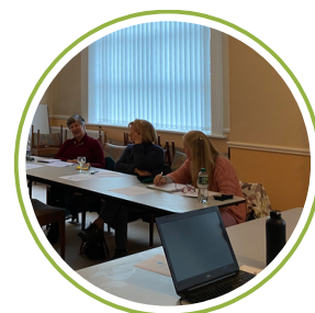
Creative Writing Workshop