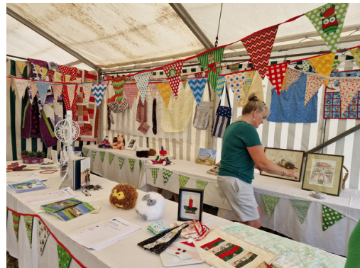
The display of crafts that the Federation showed at the Tinahely Show