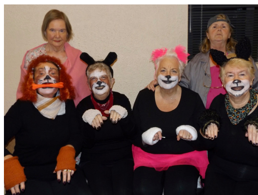
Some member of Wicklow Federation participated in the 167th Annual ICA Drama Festival