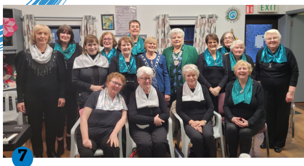
1. Members of the Monaghan Town Guild, Monaghan Federation, attending a demonstration for four autumn arrangements| 2. Members of the Lebane Guild, Galway Federation, enjoying High Tea. | 3. Members of the Ballinea Brotenstown Guild, Westmeath Federation, on their recent outing. | 4. Members of the Castlebar Guild, Mayo Federation, at the collection for the shoebox appeal. | 5. Members of Carlow Federation on their outing. | 6. Members of the Horseleap/Streamstown Guild, Westmeath Federation, busy card making. | 7. Members of Laois Federation at the Federation's Winter Conference.