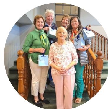
Carlow Federation on coming 3rd in the National Pitch and Putt 2022 Competitions at Seapoint Club