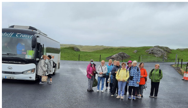
Some Longford Federation members on their trip to the Lost Valley in Louisburgh