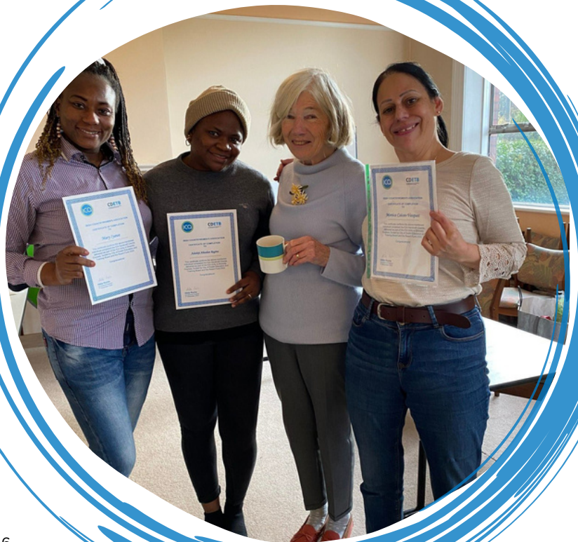
Participants of the "ICA Unity in Diversity" Project in Dublin Federation receiving their certificates

An Grianán, our Adult Education College in Co. Louth provides education, training, and specialists programmes, which ICA members can attend as individuals or in Guilds and Federations groups. It also welcomes guests, who are not members of the ICA, to a wide range of courses.