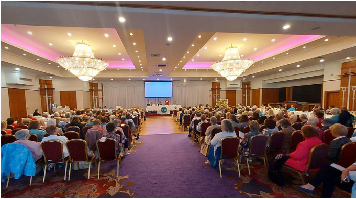
ICA members during the AGM held in Meath on the 28th of May 2022