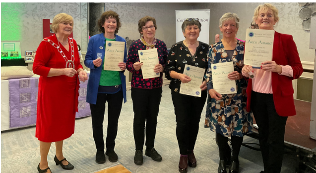
Winners of the Arts Awards receiving their prizes at the Winter Conference held in Cork on the 5th of November 2022