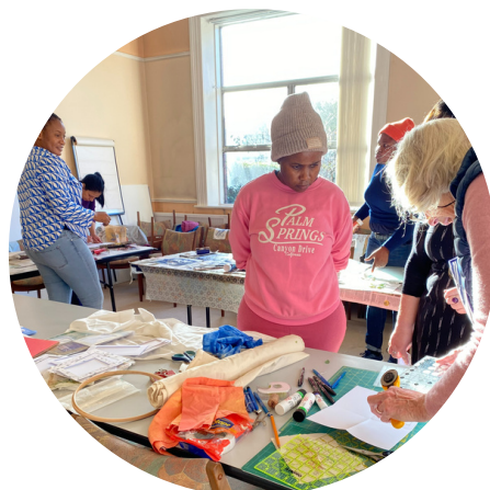
Above some participants learning hand sewn patchwork in ICA Central Office