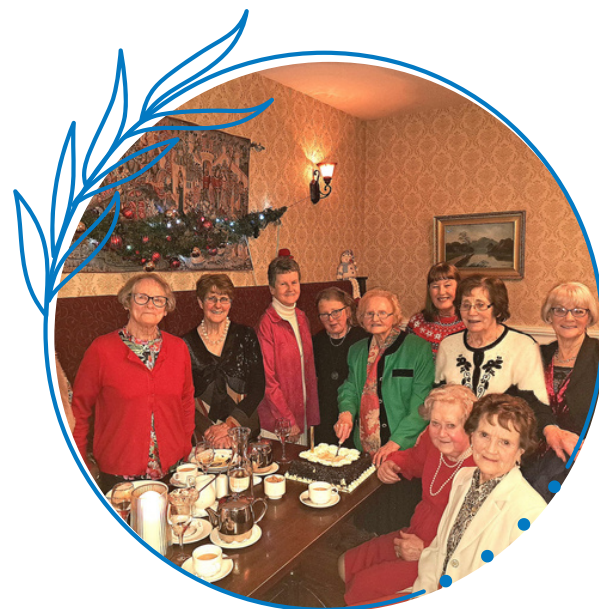
Camross Guild, Laois Federation, celebrating its 70th Anniversary

These snapshots show examples of ways in which ICA Guild activities enhance women's well-being across the country