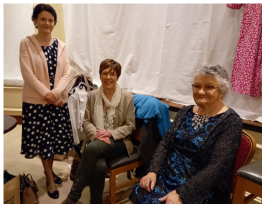
Some Longford Federation members who participated in the Fashion Show