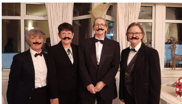
Some Wicklow Federation members who participated in the 1920's night.