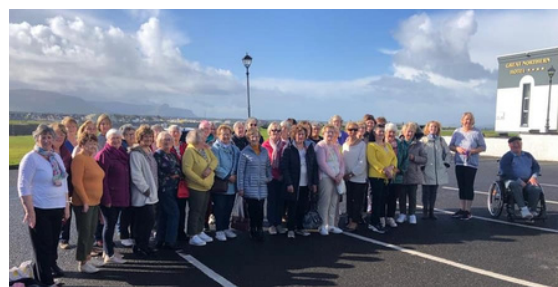
Members of Meath Federation enjoyed a wonderful 4 day trip to the Great Northern Hotel, Bundoran.