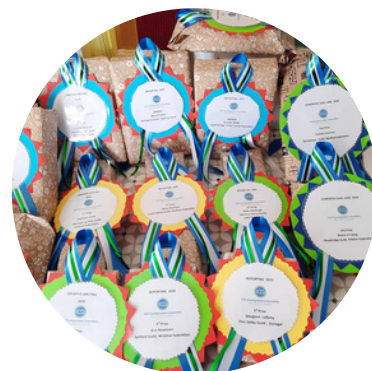
Some wonderful medals!