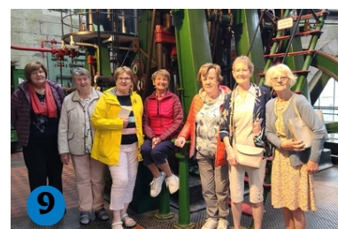
1. ICA members protesting for climate action. | 2. Members of the Dunshauglin Guild, Meath Federation, attended the Dunshaughlin Harvest Festival. | 3. Members of the Smithboro Guild, Monaghan Federation, celebrating the 42nd Anniversary of their Guild. | 4. Members of the Moyvane Guild, Kerry Federation, on their outing to East Cork. | 5. Members of the Killeshandra Guild, Cavan Federation, celebrating the 70th Anniversary of their Guild. | 6. Members of the new Guild in Millstreet, Cork Federation. | 7. Members of the Mainistir na Feile Guild, Limerick Federation, presenting a cheque for €2,287 to members of the Irish Red Cross. | 8. Members of the Castledermot Guild, Kildare Federation, visiting the Shankill Castle. | 9. Members of the Carraig na bhFear Guild, Cork Federation, celebrating the anniversary of women getting the vote.