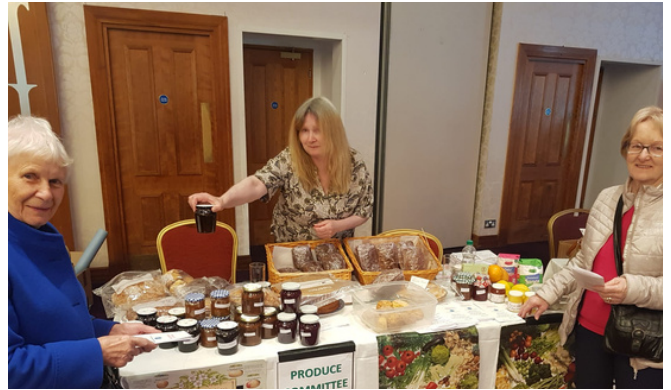
Produce Committee Stand at the AGM held in Meath on the 28th of May 2022