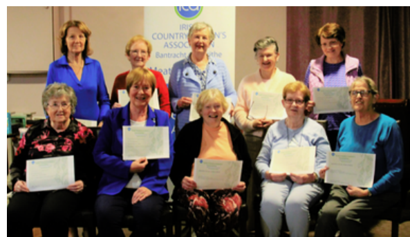
Some Meath Federation members who received certificates of achievement from their President at the September 2022 meeting.