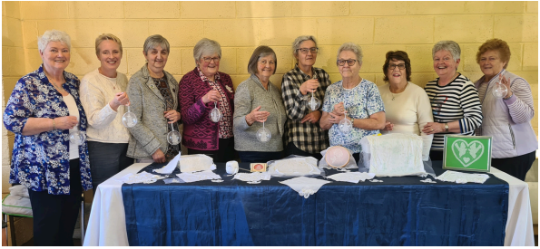
National Lace Week 2024