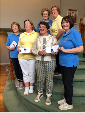
Pitch and Putt Competition 2024