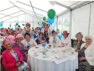
An Grianán Garden Party 2024