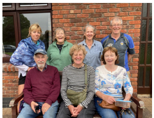
An Grianán Garden Blitz 2024