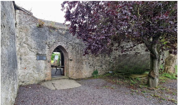
An Grianán Garden 2024